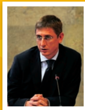
Ferenc Gyurcsány Prime Minister

"We would like to attain the goal that tens or hundreds of thousands of Hungarian SMEs would benefit from both high-level ICT skills and digital literacy as a natural part of their everyday lives."