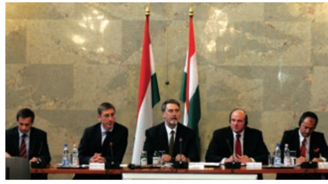
The launch press conference of the TITAN Programme was held on the 19th of May in Budapest, in the Delegation Hall of the Hungarian Parliament, hosted by the ICT

Subcommittee of the Parliament. The launch meeting (though by invitation only) attracted cca. 80 very high level speakers and participants (including Ministers, Hungarian, CEE and EMEA level CEOs, MEPs, MPs, top-level representatives of business, civil society, academia) and enormous press attention. A TITAN Memorandum of Understanding was ceremonially signed between the HELB, the Hungarian Government, all five parliamentary political parties, the Parliamentary ICT Subcommittee, and the Hungarian Enterprise Development Foundation.